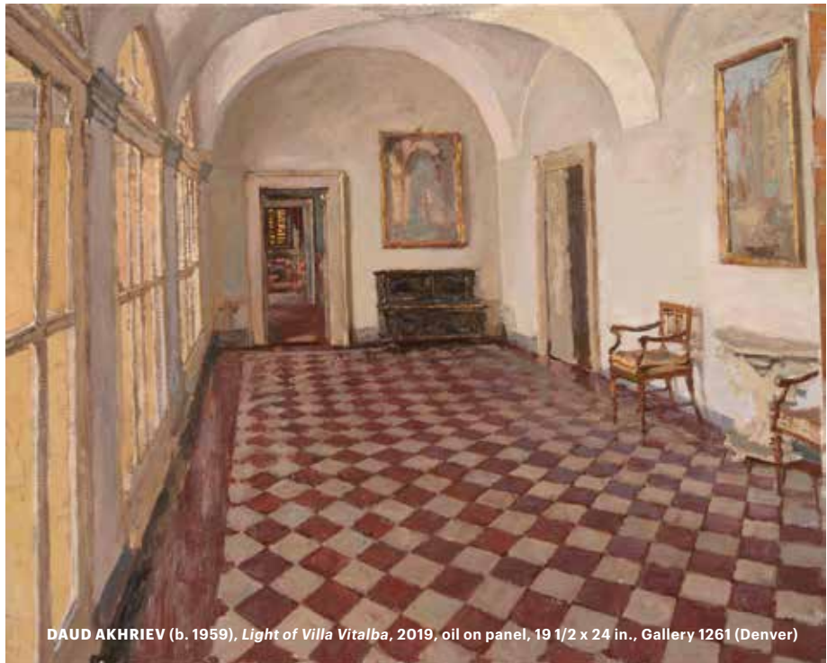
DAUD AKHRIEV (b. 1959), Light of Villa Vitalba , 2019, oil on panel, 19 1/2 x 24 in., Gallery 1261 (Denver)

Please savor this array of atmospheric images, and — just for fun — try composing a picture in your mind next time you pass through one of your favorite interiors. If it's an especially good one, don't hesitate to steer your artist friends there so they can depict it for themselves. Collaborations like this are one crucial part of how art gets made. ●