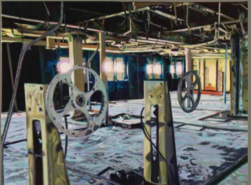
(CLOCKWISE FROM TOP LEFT) DOUG WEBB (b. 1946), Dual Nature , 1984, acrylic on Belgian linen, 50 x 40 in., private collection ■ JEFF BYE (b. 1971), Projector Room , 2019, oil on linen, 17 x 28 in., private collection ■ JILL STEFANI WAGNER (b. 1955), Happy Hour , 2015, oil on linen, 8 x 16 in., private collection ■ MARIA MIJARES (b. 1951), Hand Wheels (SS United States) , 2013, acrylic on linen, 18 x 24 in., available through the artist ■ GEORGIOS TAXIDIS (b. 1987), Untitled , 2020, pencil and charcoal on paper, 29 9/10 x 18 4/5 in., available through the artist and Athens Art Gallery (Greece)