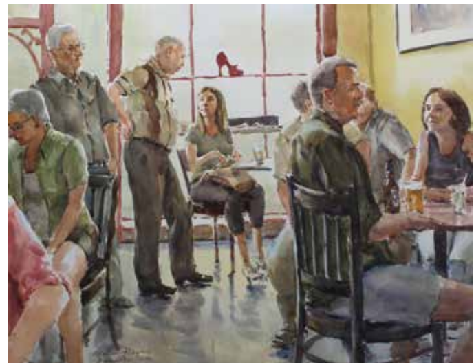
(CLOCKWISE FROM TOP LEFT) JOSEPH GYURCSAK (b. 1962), Light Path , 2022, oil on panel, 18 x 40 in., Hagan Fine Art Gallery (Charleston) ■ WILLIAM ROGERS (b. 1949), Chatting Her Up at the Red Shoe , 2020, watercolor on paper, 19 x 25 in., Down to Earth Gallery (Yellowknife, Nova Scotia) ■ HAIDEE-JO SUMMERS (b. 1971), Morning Light in the Studio , 2023, oil on linen, 28 x 30 in., available through the artist ■ JILL BANKS (b. 1958), Sanctuary , 2021, oil on linen, 36 x 36 in., available through the artist ■ SARA LEE HUGHES (b. 1968), M's Point of View , 2021, oil on canvas, 48 x 68 in., Commerce Gallery (Lockhart, Texas)