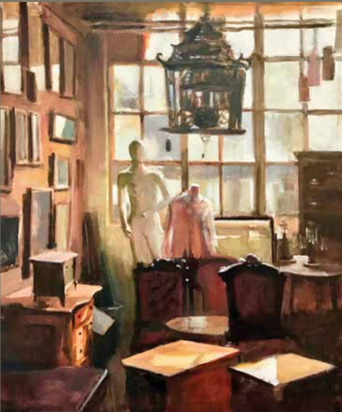
(CLOCKWISE FROM TOP LEFT) DEBRA LOTT (b. 1951), Passage , 2021, oil on canvas, 40 x 30 in., 33 Gallery Contemporary (Chicago) ■ CARLOS SAN MILLÁN (b. 1969), Interior #181 , 2022, oil on wood, 15 x 21 2/3 in., private collection ■ LARRY MOORE (b. 1957), The Visitor , 2023, oil on wood, 40 x 40 in., private collection ■ JULIE RIKER (b. 1969), Mannequin by the Window , 2018, oil on canvas, 30 x 20 in., private collection