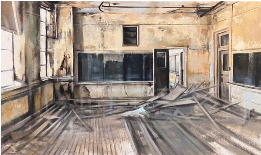
4 Projector Room at the Palace , oil on linen, 19 x 52"